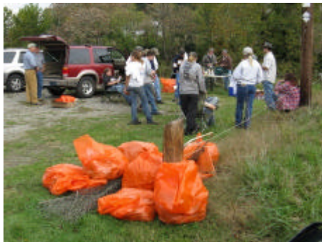
TU members and Ledford High students enjoy hotdogs after collecting trash on the Mitchell River.

We changed our website this Fall to update the appearance and add functionality. Go to http://www.blueridgetu.org and check it out. If your internet browser still takes you to the old Piedmont Communities site, type or click the link above.