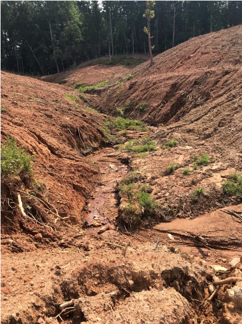
Photo 3: Grubbing/grading of stream banks causing complete destruction of channel geomorphology