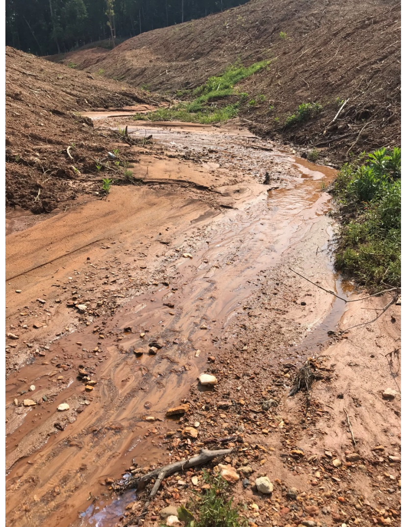
Photos 1 & 2: Extreme sediment deposits in stream channels causing complete destruction of channel geomorphology